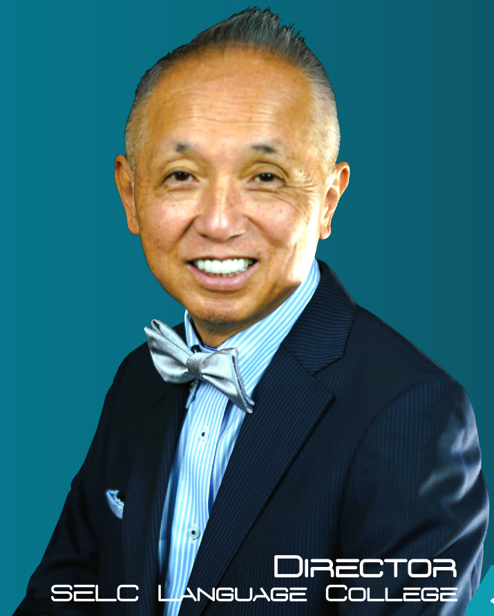
DIRECTOR SELC LANGUAGE COLLEGE

We've developed our teaching method based on the above concept. SELC's approach will help you command English communication skills faster and more effectively than other commonly used teaching methods. SELC's focus is always speaking and listening with an emphasis on good pronunciation and being able to talk in front of people. Come to SELC Language College. I look forward to helping you become fluent in English.