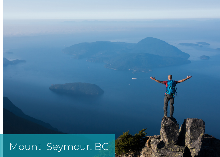
Mount Seymour, BC

SELC Language College organizes all kinds of activities on and off campus. We have student and staff-led clubs for sports, music, dance, and conversation practice. Throughout the year we host different activities: bowling, potluck, seawall biking, field trips, and more.