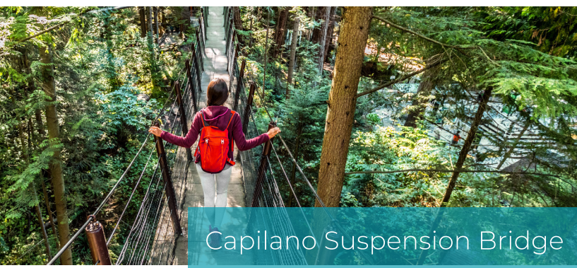
Capilano Suspension Bridge

We are also partnered with one of the biggest tour companies in Vancouver to help you explore our lush city and country. Have fun, travel, sightsee, enjoy discounted activities, and practice your English!