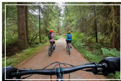
MT. SEYMOUR, BC