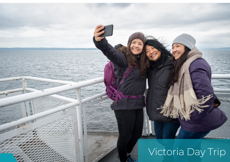
Victoria Day Trip